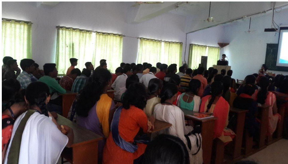
Students expressing their views in the Inaugural Function of the Course